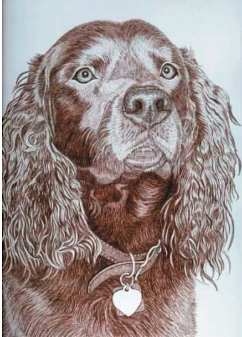
2010 National Specialty & Hunt Test New London, WI

Pre-order your 2010 National Specialty shirts now to ensure you get the correct size and color.